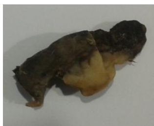
Fig. 2: Grossly the appendix measured 6.5×0.6 cm, with small nodules in the wall of the appendix measuring 5×3×2 mm with tan to greyish black in color and rubbery consistency