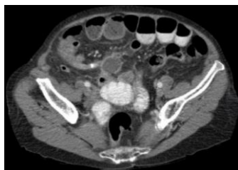
Fig. 1: Computed tomography scan of abdomen and pelvis with intravenous and oral contrast revealed a mildly dilated appendix, measuring 7.5 mm in diameter, and mild wall thickening consistent with acute distended appendicitis

CT scan and diagnostic laparoscopy has revealed no other sites of endometriosis.