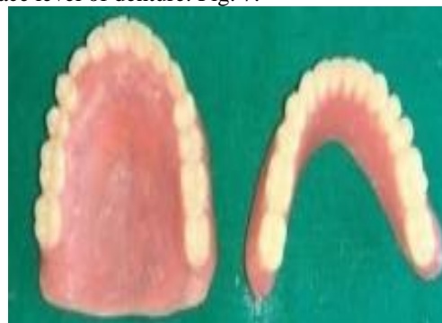
Fig. 5: Grooves are created on the maxillary Prosthesis

clear acrylic resin is placed over the barcode till the surface level of denture. Fig. 7.