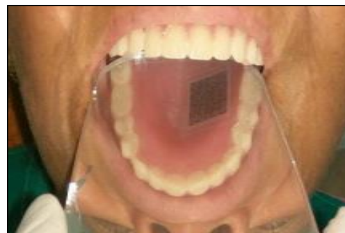
Fig. 11: QR code scanned details