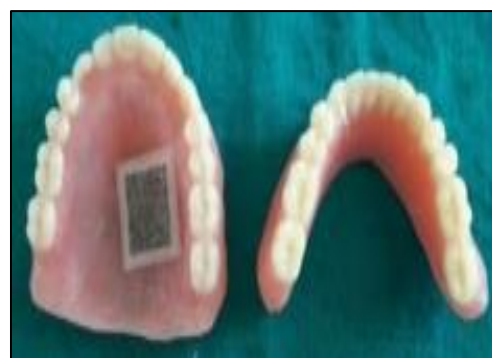
Fig. 7: QR Code is placed