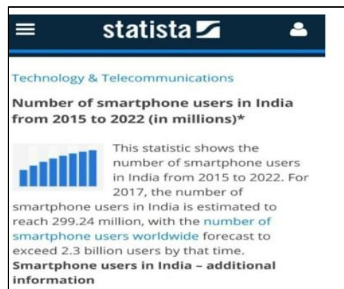
Fig. 1: Smart phone years in the year 2017

Inclusion and it is one of the best technique because of its simplicity and accuracy. According to the survey "The number of population using smart phone in India is estimated to reach 299.24 million, with the number of smart phone users worldwide forecast to exceed 2.3 billion users by that time in 2017. The number of smart phone users worldwide is projected to amount to nearly 2.7 billion by 2019." Fig. 1 and Fig. 2 QR codes are very common in daily life and most people are exposed to them in the media on a daily basis. QR code stands for Quick Response code and is a two dimensional barcode created in Japan in 1994 for the automotive industry. It is formed by black squares arranged on a square grid. It has a white background and can easily be optically read with an imaging device such as the camera of a smart phone that has the appropriate program installed. It can hold large amounts of information, up to 4,296 alphanumeric characters. 15 this characteristic and the fact that it is easily generated and read makes it ideal to use in denture labeling.