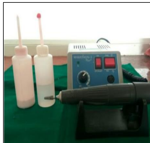
Fig.3: Clear Acrylic, Junction Box

The material used - QR Code, QR Code Scanner, Lamination, Denture, Clear Acrylic Resin Fig. 3.