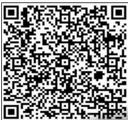
Fig. 4: QR Code is generated

Barcode: A barcode is an optical machine-readable code in the form of patterns which is a representation of data barcode scanner is used to read this kind of patterns. Barcodes is a better incorporation. Technique as it stores a huge amount of patient's details as compared to labels which just includes name and ID number. Quick response code is a two dimensional (2D) type of barcode 16,17 Fig. 4.