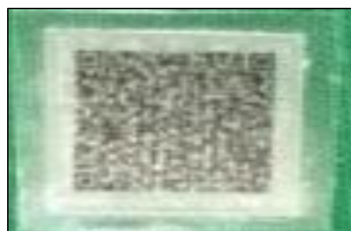
Fig.6: Laminated using clear acrylic resin