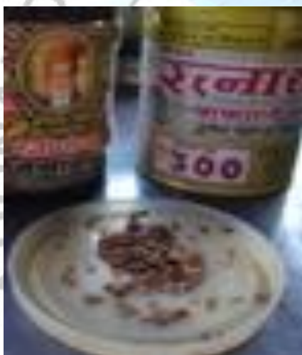
Fig. 8: Loose Form