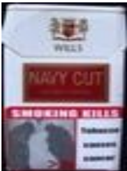
Fig. 7: follow 40% display and local language law