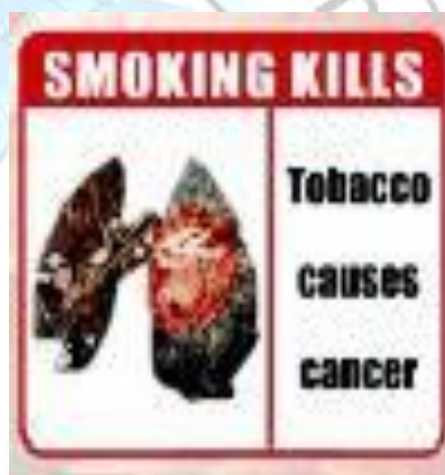
Fig. 5: Correct Display