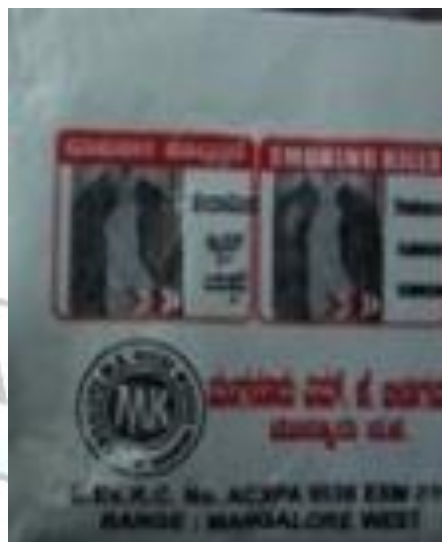
Fig. 4: Unclear Display.