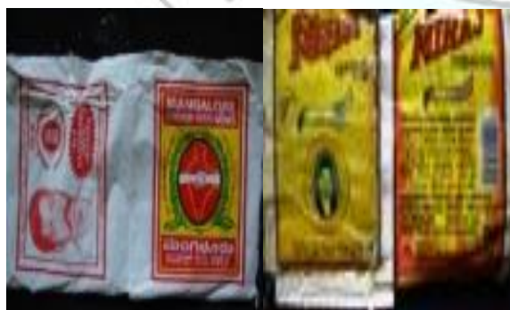
Fig. 3: Without statutory warning