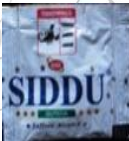
Fig. 6: violating 40% display and local language law