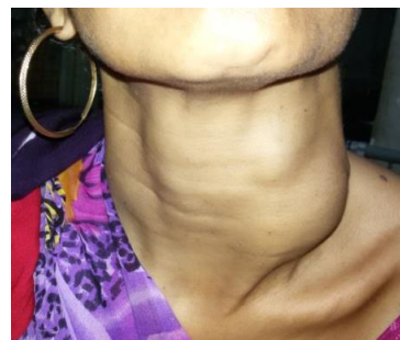
Fig. 1: Clinical photograph of swelling

later revealed no residual thyroid. The patient is on thyroxine supplementation and regular follow-up.