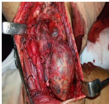
Fig. 4: Intra-operative photograph