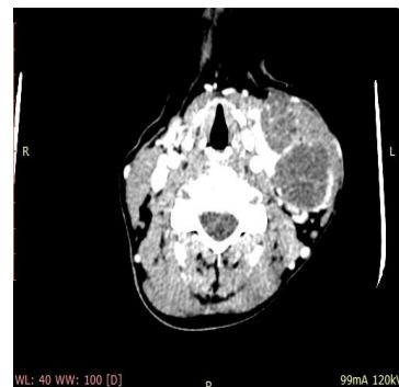
Fig. 3: CT scan film