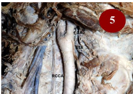
Fig. 2: STA arising from RCCA 0.5 cm below bifurcation