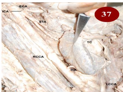
Fig. 3: ITA arising from RCCA 5 cm above origin of RCCA