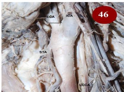
Fig. 1: STA arising from LCCA 2 cm below bifurcation

The study will be useful for surgeons during various surgeries which involve CCA as well as its additional branches to avoid fatal complications.