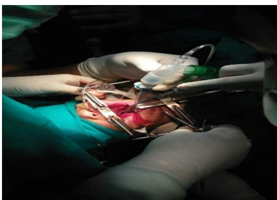
Fig. 2: Picture showing surgery in progress

We will be discussing the anaesthetic management of such difficult airway cases under ideal conditions and also in places which function on limited resources.