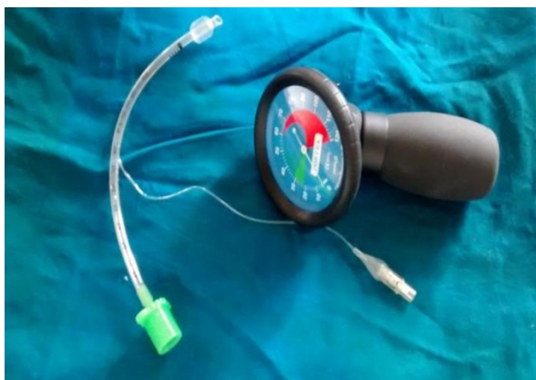
Fig. 1: Microcuff paediatric endotracheal tube and pressure transducer

ventilation. (5,6,7) With MPPT, cuff was inflated using pressure manometer(Fig. 1) to sealing pressure of 20 cm of H 2 O or till the leak stopped whichever was attained earlier. At 20cm of H 2 O of cuff sealing pressure, if still air leak was present tube was judged to be small and exchanged for next larger size(+0.5 mm). Minimal cuff pressure required to seal the airway and quality of sealing was recorded. Immediately after intubation, with either of the tubes if there was no audible air leak, the tube was judged to be bigger and exchanged for one smaller size(-0.5 mm). If there was excessive air leak with uncuffed tracheal tube not allowing adequate ventilation, it was exchanged for next larger size. Further, number of TT exchanges to find the appropriate-sized tube was recorded. Patients were maintained on O 2 , N 2 O, Inj. Atracurium 0.1mg/kg and volatile anesthetics. At the end of surgery patients were extubated after reversal with inj.Neostigmine and inj.Glycopyrrolate. Patients were observed for post-extubation stridor immediately, 2 nd hr and 6 th hr.