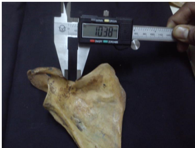
Figure 2: Measurement for Superior transverse diameter of Supra Scapular Notch

Measurements taken for each suprascapular notch and superior transverse scapular bar are as follows-