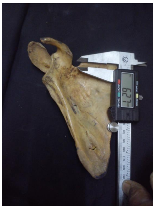
Figure 1: Measurement for depth of Supra Scapular Notch

This study also includes scapulae where suprascapular notch was absent. The scapulae with broken superior border were excluded from this study. Measurements of suprascapular notch were made using classic osteometry with the digital Vernier calliper and these were recorded in millimetres. Digital Vernier caliper (manufacturer – Aerospace, India) used in this study was of resolution of 0.01mm. The data was analyzed statistically (figure 1 & 2).