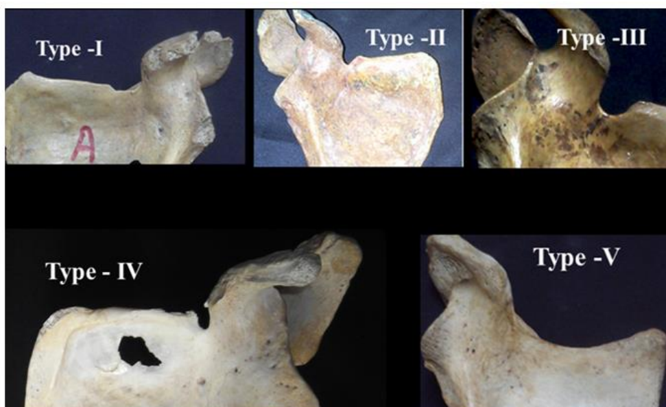
Figure 4: Photographs showing different type of Supra scapular notches (Type 1: without discrete notch, Type 2: 'V' shaped, Type 3: 'U' shaped, Type 4: Inverted 'V' shaped, Type 5: Without Notch)

Type -I (n= 36) were without discrete shaped suprascapular notch (ill defined –not having continuous margin). Type -II – V shaped (n=79, having wide superior transverse diameter, narrow inferior transverse diameter) and Type -III – U shaped (n= 132, having nearly equal superior & inferior transverse diameter) (figure – 4). Measurement value of Superior, inferior transverse diameter and depth are showing in table -2.