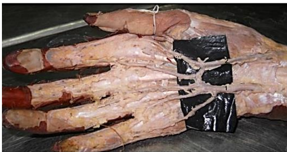
Fig. 1: Type 1 Complete Arch: Ulnar artery (1) & superficial palmar branch of radial artery (Right)

Type 1 Complete arch: In the present study, the arch completed by ulnar artery and superficial palmar branch of radial artery is the most common type, seen in 26 hands(65%). In this pattern the radial artery before passing dorsally to the anatomical snuff box, gives superficial palmar branch which passes to the palm either superficial or deep to the thenar muscles and ends by anastomosing with terminal end of ulnar artery.(Fig. 1)