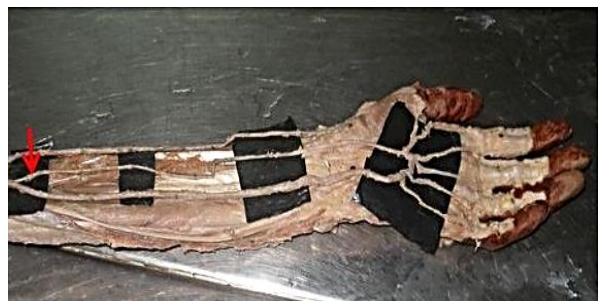
Fig. 3: Type 3 complete arch: Ulnar artery & median artery. (Arrow-Median artery arising from ulnar artery) (Left)

Incomplete arches are seen in 9 hands and 2 different patterns were observed.