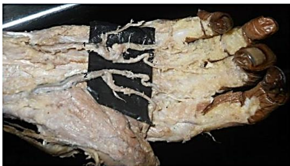
Fig. 5: Type 2 incomplete arch: Ulnar artery (1) & superficial palmar branch of radial artery (2) without anastomosis (Right)

Type 2 incomplete arch: In this type, the palm is supplied by ulnar artery and superficial palmar branch of radial artery separately without any anastomosis between them. It is seen in 2(5%) hands. Medial three fingers are supplied by ulnar artery and lateral two fingers are supplied by superficial palmar branch of radial artery. (Fig. 5)