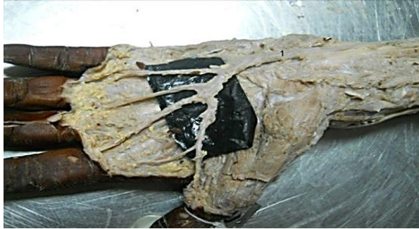
Fig. 4: Type 1 incomplete arch: Ulnar artery (1) alone. (Left)

Type 2 incomplete arch: In this type, the palm is supplied by ulnar artery and superficial palmar branch of radial artery separately without any anastomosis between them. It is seen in 2(5%) hands. Medial three fingers are supplied by ulnar artery and lateral two fingers are supplied by superficial palmar branch of radial artery. (Fig. 5)