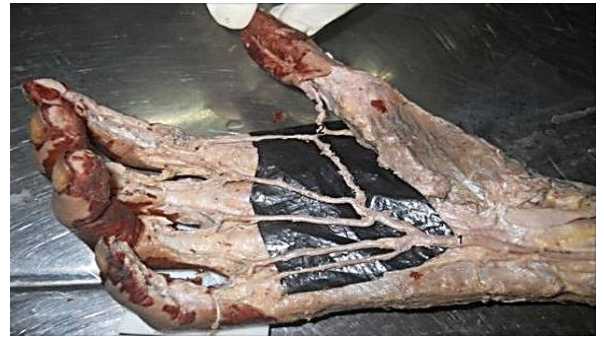
Fig. 2: Type 2 complete arch: Ulnar artery (1) and princeps pollicis artery (2) Right

Type 2 complete arch: Arch completed by ulnar artery and princeps pollicis branch of radial artery. Out of 31 complete arches 3(7.5%) hands presents this pattern. Radial artery in the present case passes dorsally at wrist and traverses the anatomical snuff box. It passes between the two heads of first dorsal interosseous muscle and enters into the palm. In the palm it completes the arch by anastomosing with terminal end of ulnar artery and supplies the thumb as arteria princeps pollicis. (Fig. 2)