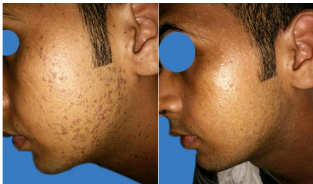
Fig. 4: 22 years male plane wart (a) pretreatment and (b) complete clearance after 4 weeks.