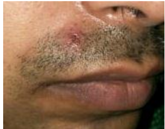
Fig. 6: Erythema and swelling after PPD injection in a patient of verruca vulgaris.