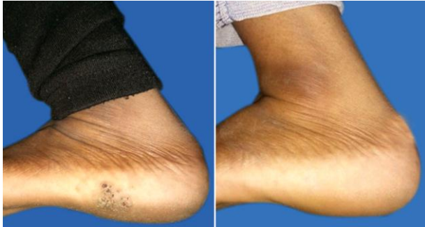
Fig. 1: 19 years female plantar wart (a) pretreatment and (b) complete clearance after 5 weeks.