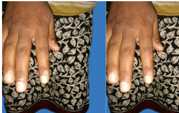
Fig. 2: 38 years female periungual wart (a) pretreatment and (b) complete clearance after 5 weeks.