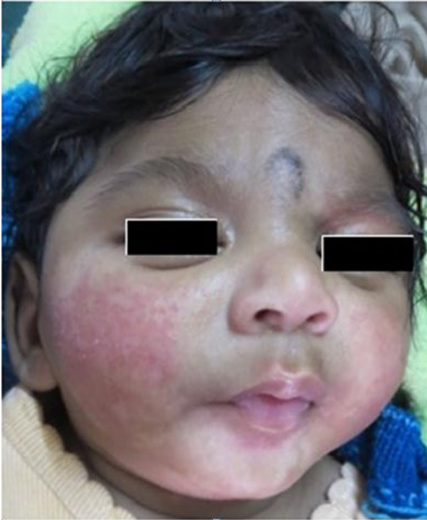
Fig. 2: Facial involvement