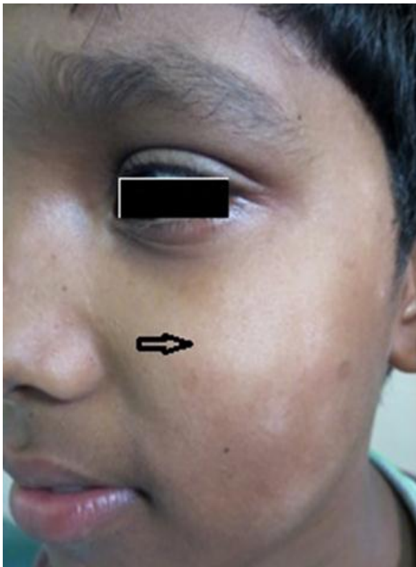
Fig. 3: Pityriasis alba