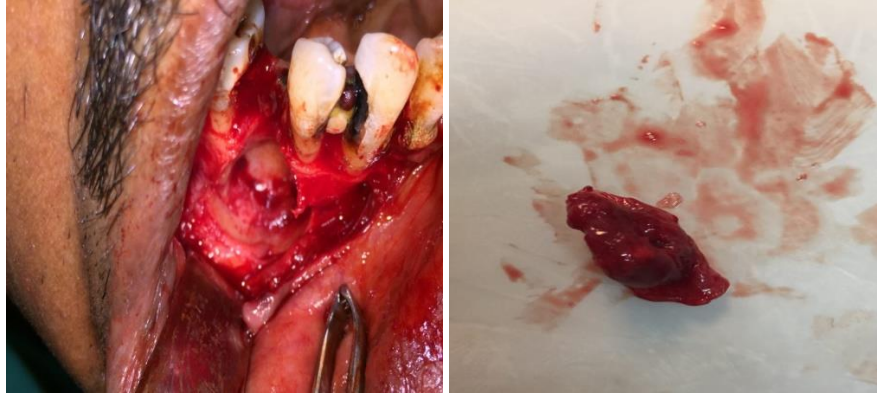
Fig. 3&4: Defect bone seen after enucleation of the cystic lesion. The involved bone surface was resorbed and there was presence of scalloped bone surface; Enucleated lesion