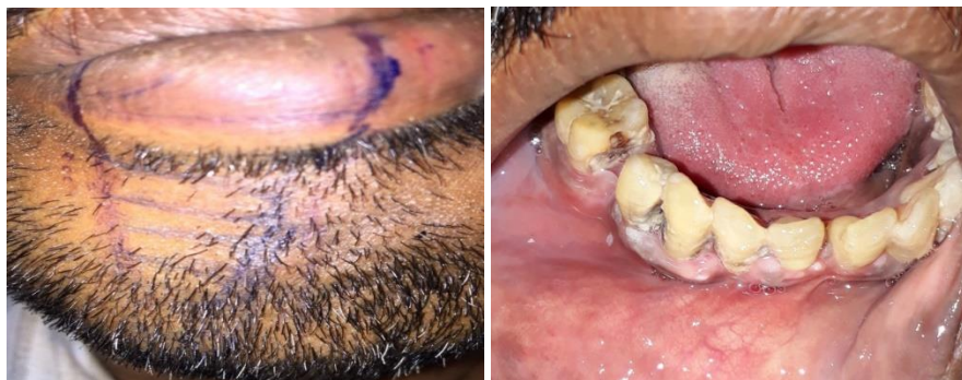
Fig. 5&6: Mapping done on the involved surface; right lower lip and medial portion of chin; the affected area was entirely healed (post treatment picture).