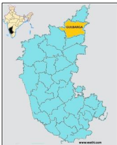
Fig. 1: Map of the Karnataka with study site-Kalaburagi district

Month wise assortment of the dengue infected patients showed wide infection rate during April to December over the period of this study. During 2018, a narrow infection was also observed during the months of January to March (Fig. 2).