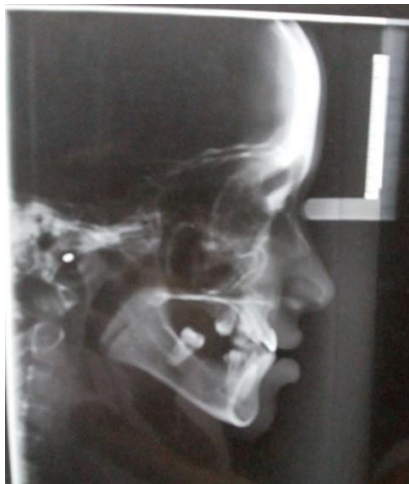
Fig. 3: Lateral cephalogram of patient