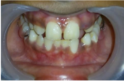
Fig 1: Picture showing intra oral occlusion and condition

was advised at six months interval. A daily mouth rinse was prescribed and added importance of daily tooth brushing and flossing was emphasized to the child and parent to minimize the possibility caries and periodontal disease. As the age advances permanent prosthesis with implant was advised for rehabilitation and replacement of missing teeth.