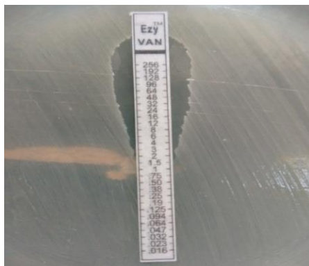
Fig. 3: E-test for detection of vancomycin resistance