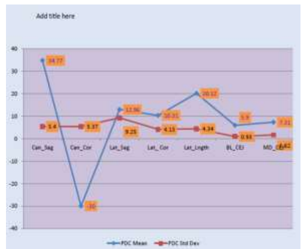
Line graph of angular (°) and linear (mm) Variables comparing the palatally displaced canine and the control groups