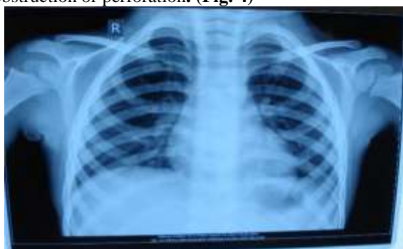
Fig. 1: Posterior-anterior Radiograph of the Chest Region Showing Clear Field