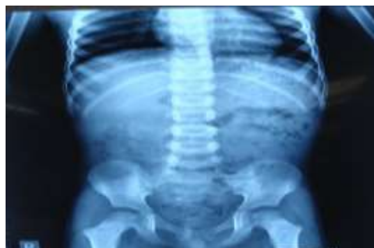
Fig. 4: Anteroposterior X-Ray of Abdomen Showing Clear View; No Evidence of the Endodontic File