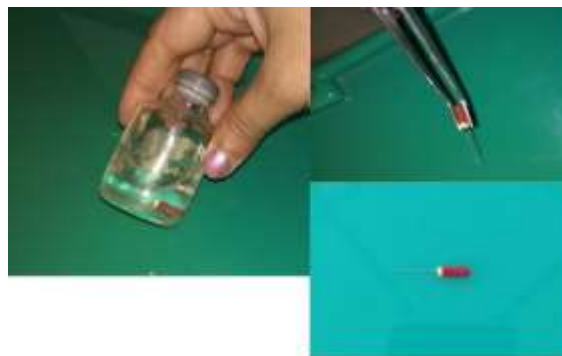
Fig. 3: Retrieved 25 no. Endodontic K-file of 21mm length, intact and unbroken