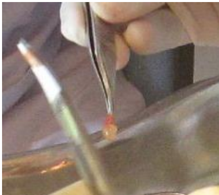
Fig. 7: PRF prepared to match the size of the defect

The upper layer is removed and middle fraction of PRF was collected. The PRF is the platelets trapped in high concentration in fibrin meshes.