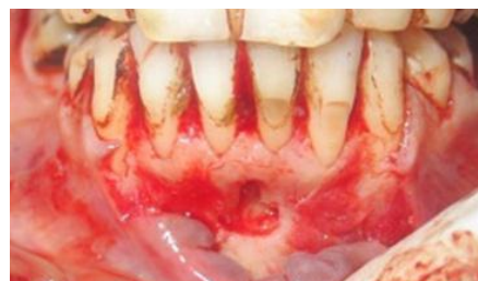
Fig. 6: Bone defect after curettage