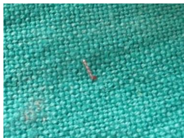
Fig 4: Instrument retrieved

An osseous defect was visualised associated with the periapical region of 31. Complete curettage of the periapical area was done with a molt curette. The apical 3 mm of the root of 31 associated with the osseous defect was resected perpendicular to the plane of the root.