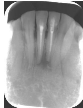
Fig. 9: Three months follow up

3 months later post endodontic restorations were given on 31 & 41