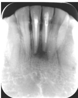
Fig. 8: One month follow up

The prepared PRF was carefully cut to roughly match the size of the osseous defect and was carefully placed in the defect with a tissue forceps. The flap is carefully placed back in to position without disturbing the PRF in position. (Fig 7). Sutures were placed. One week later sutures were removed and access in to the canals reopened and the remaining portion of the root canals were obturated using AH plus sealer and the corresponding sizes of gutta-percha cones. One month and 3 months review of the patient and radiographic evaluation of the periapical area was done. The teeth were asymptomatic and the radiographs revealed the appearance of a healing lesion with sufficient amount of bone regeneration at the periapical osseous defect area. (Fig. 8). (Fig. 9)