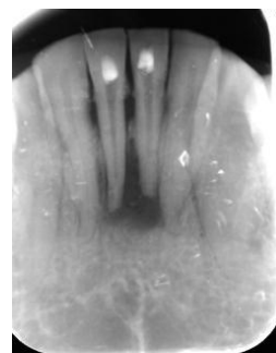
Fig 5: MTA packed at apical 6mm and apicectomy done

At the time of evaluating the working length RVG, the root canals of 31 and 41 were found to be having open apices and this was confirmed during the root canal instrumentation procedure. So after drying the root canals of 31 and 41 with paper points, white MTA (Proroot) was packed in the apical 6 mm area of 31 and 41 to ensure the complete sealing of an open apex. The access cavity was sealed with a temporary cement. (Fig. 5), (Fig. 6).