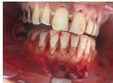
Fig. 3: Separated instrument exposed

After administering local anesthesia, a full thickness rectangular muco-periosteal flap was reflected in the buccal aspect of 31 and 41, this was achieved by giving intra crevicular incisions extending from the distal aspect of 33 to the distal aspect of 43 and two vertical releasing incisions given at 33 and 43. Flap was retracted and after achieving proper hemostasis and irrigating the peri-apical area with copious amount of normal saline the separated instrument was visible at the peri-apical region of 31. The instrument was retrieved by a mosquito forceps. RVG was taken to confirm no fragments of separated instrument was remaining in the area. (Fig. 3), (Fig. 4).