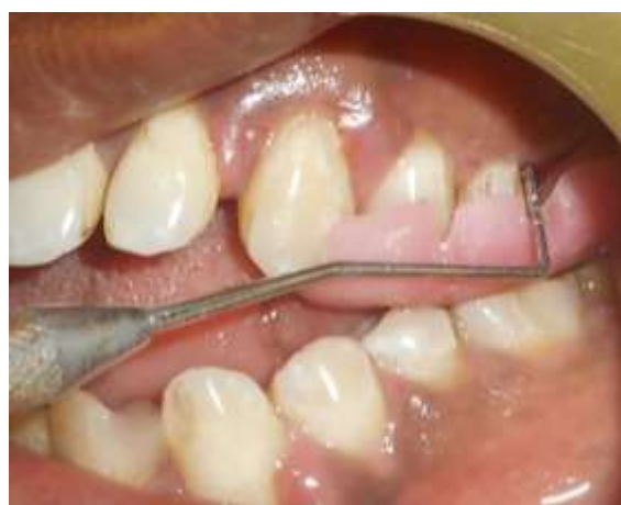
Fig. 1: Placebo group

Periodontal diseases are a group of diseases characterized by inflammation of periodontium and the subsequent destruction of the tooth supporting tissue. Chronic periodontitis is a disease that progresses slowly and generally becomes clinically significant in adults. Probiotics uses harmless bacteria to displace pathogenic organisms and it is a promising way of combating infections. WHO and FAO of the United States in 2001 defined probiotics as living microorganisms which when administered in adequate