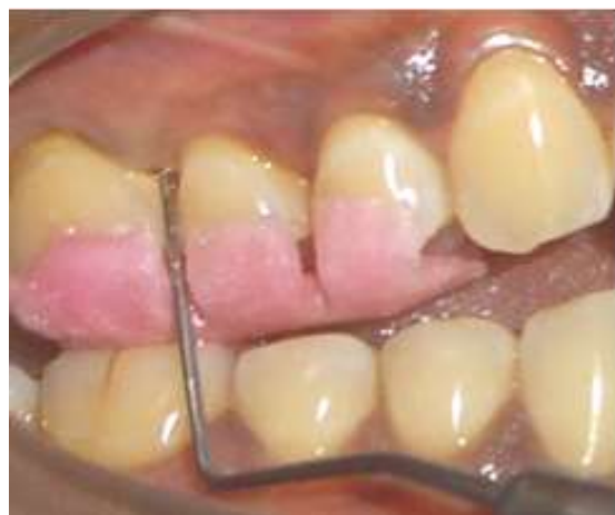
Fig. 2: Probiotic group