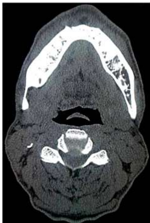
Fig. 3: Axial CT view showing defect