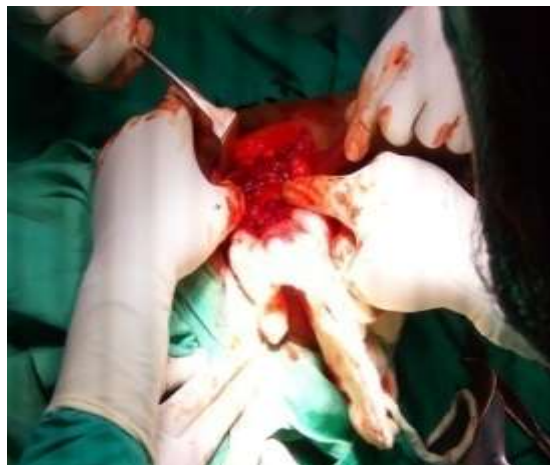
Fig.1: Mopping of wound

Injection of tranexamic acid was given in a dose of 10mg/kg body weight as bolus injection (group A) administered by slow intravenous route over five minutes. The respiratory rate, heart rate and blood pressure were measured and recorded for all the cases both intra and post operatively. The same brand of the drug from a well reputed company was utilised in all the cases so as to reduce the brand related bias for the drug and for standardization. Intraoperative loss of blood was measured by weighing the mops used and soiled by blood, while mopping the wound ( Fig. 1 ) and measuring the amount of blood collected in suction apparatus used during the surgery ( Fig. 2 ). A suction drain was kept in all the patients before wound closure ( Fig. 3 ). The samples of venous blood were drawn from all the cases both pre and post operatively to compare haemoglobin levels. The drain fluid accumulated in the suction drain postoperatively was also measured after 24 hours and also after 48 hours when the drain was removed. All the cases were followed up until they were either discharged from hospital or the operative wound sutures were removed.