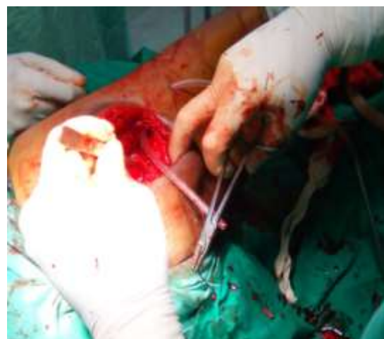
Fig. 3: Fixing suction drain