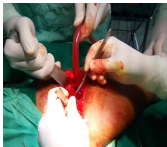
Fig. 2: Continuous suction