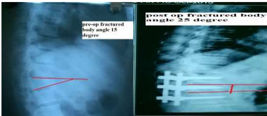
Pre-op post-op Fig. 4: fractured body angle