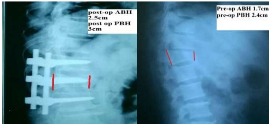
Pre-op Post-op Fig. 2: sagittal cobb's angle