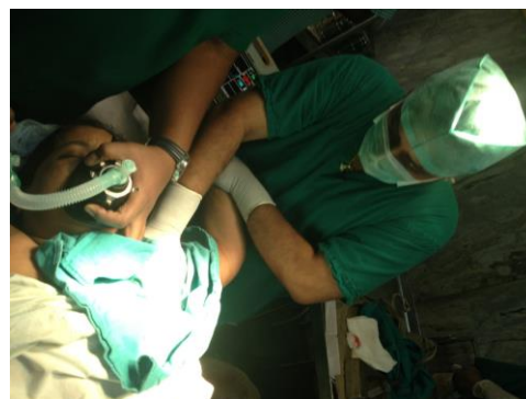
Fig. 2: Overhead abduction of shoulder after injection of cold normal saline and 2% xylocaine into the shoulder