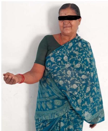
Fig. 5: External rotation before MUA