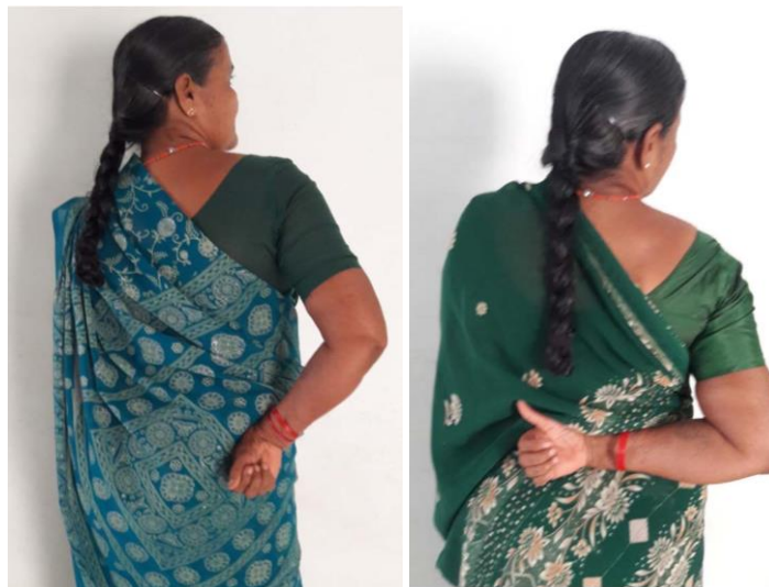
Fig. 7: Internal rotation before MUA