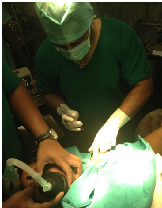
Fig. 1: Picture showing procedure for injecting cold normal saline in to shoulder joint (palpating coracoid process and injecting needle lateral to it)

Values given in brackets are standard deviation. P value =0.0005