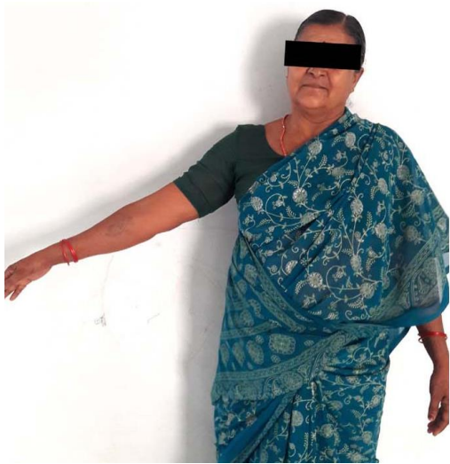
Fig. 4: Abduction before MUA