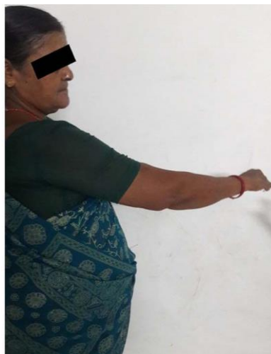
Fig. 6: Flexion before MUA