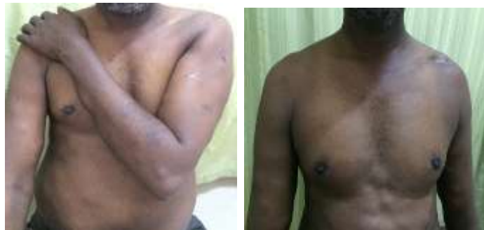
Good range of movements achieved