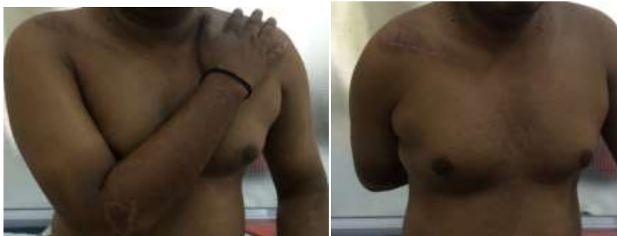
Good range of movements achieved