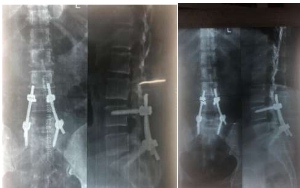
Immediate post operative X-ray