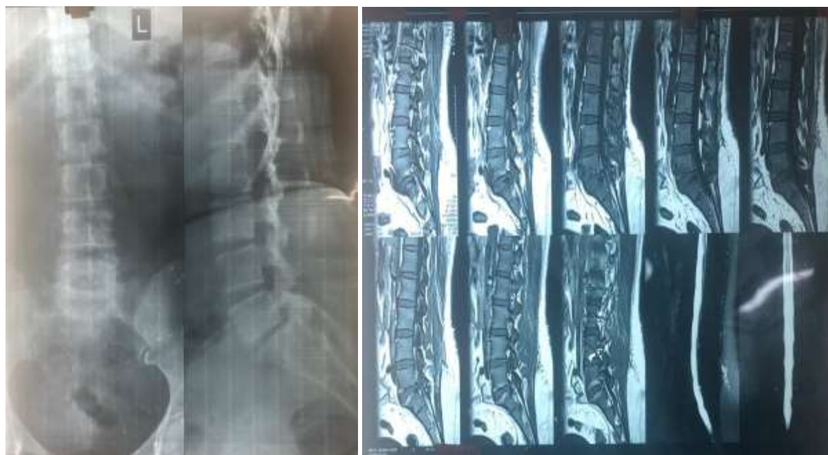
Pre-Operative X –Ray