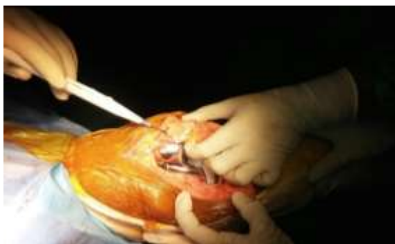
Fig. 1: Patellar rim cauterization