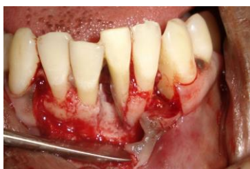
Fig. 3: The periodontal flap elevated & the intrabony defect debrided with 31 & 41

The test tube was placed into centrifugation machine and centrifuged at the 3000 revolutions per minute (rpm) for 10 min. The test tube showed supernatant plasma, platelet concentrate and red blood cells at the bottom. The platelet rich fibrin (PRF) obtained was then placed in the defect (Fig. 4). The healing was uneventful. A follow up of 6 months showed reduction in clinical probing depth and increase in radio density on the post operative radiograph suggestive of regeneration (Fig. 5, 6).