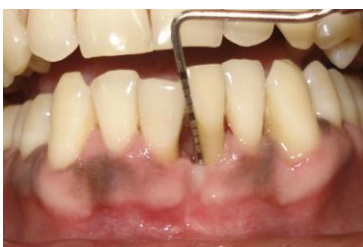
Fig. 5: One year post-operative photograph showing 3 mm healthy sulcus and gingival recession