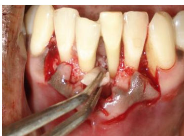
Fig. 4: PRF placed in the defect