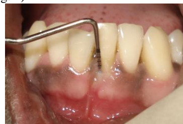
Fig. 1: Pre-operative photograph showing 10 mm periodontal pocket depth with 31

vertical bone loss and arch shaped defect with incisors, premolars and molars. On the basis of clinical and radiographic examination diagnosis of generalized aggressive periodontitis was made. Clinically pocket depth of 10 mm was present in respect to 31 (Fig. 1) while intraoral radiograph showed an intraosseous defect. (Fig. 2)