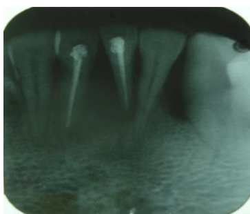
Fig. 6: One year post-operative radiograph with increase radioopacity with 31 suggestive of regeneration