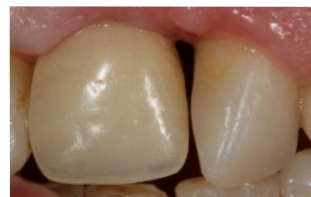
Fig. 4: Result observed after 4 applications of hyaluronic acid. (Els. 21 e 22)

The patient was informed that this was a new treatment option, and signed a treatment consent form and image rights consent form. The application methodology was based on the work of Becker et al 2010, 29 in which it was reported that the acid must be done 2-3 mm from the gingival margin. The injection was given 4 times in a 3-month period with a 0.06-0.1ml hyaluronic acid dose for each of the applications (Fig. 4).