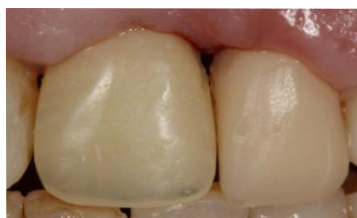
Fig. 7: Widening of the interdental spaces, intrasulcular incision and hyaluronic acid application. (Els 21 e 22)

After reaching this objective the option was taken to widen the space between the teeth by wearing down the temporary crown. An intrasulcular incision was performed under local anesthesia to promote the inflammatory process followed by an immediate application of 0.1 ml of hyaluronic acid and thus promoting the increase in papilla height (Fig. 7).