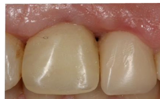
Fig. 8: Reevaluation 17 days after procedure and new hyaluronic acid application. (Els. 21 e 22)

An increase in papilla growth of 1.0 mm (Fig. 8A and B) was analyzed and measured through computerized comparisons.