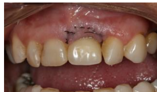
Fig. 2: 10 days post-op. (El. 21)

In 10 days post-op a satisfactory soft tissue coronal migration was observed, with papilla formation (Fig. 2)