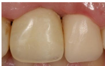
Fig. 6: Papilla after two other applications within a 30 day interval after temporary tooth installation (Els. 21 e 22)

After reaching this objective the option was taken to widen the space between the teeth by wearing down the temporary crown. An intrasulcular incision was performed under local anesthesia to promote the inflammatory process followed by an immediate application of 0.1 ml of hyaluronic acid and thus promoting the increase in papilla height (Fig. 7).