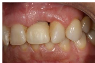
Fig. 3: 60 days into post-op

Sixty days into post-op a margin and papillae apical recession was perceived between the central and lateral left maxilar incisors, forming a “black triangle” (Fig. 3).