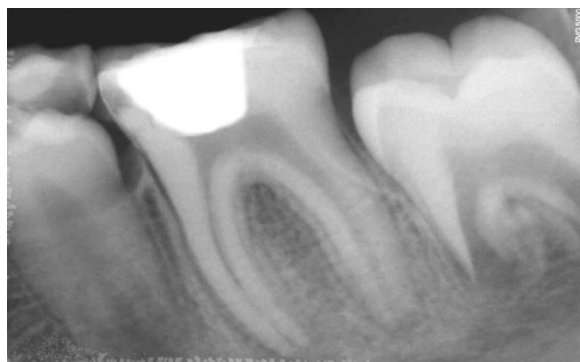
Fig. 2: 6 month follow- up showing continued root development.