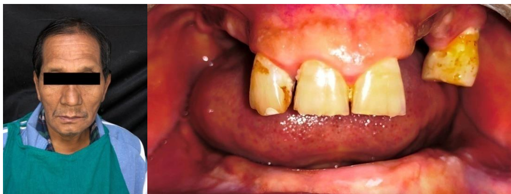
Fig. 2: Extraoral and intraoral photographs