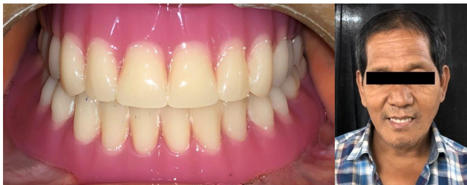
Fig. 8: Final denture insertion