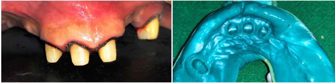
Fig. 4: Prepared tooth with gingival retraction followed by putty and light body impression