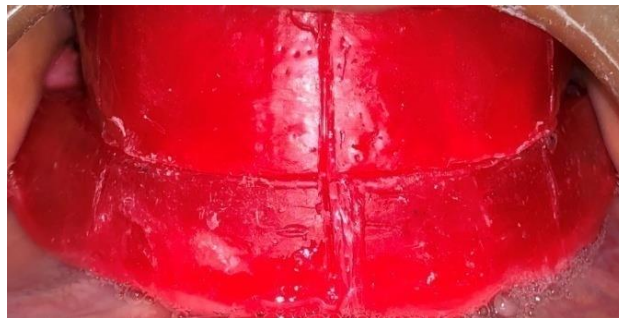
Fig. 6: Maxillomandibular relation