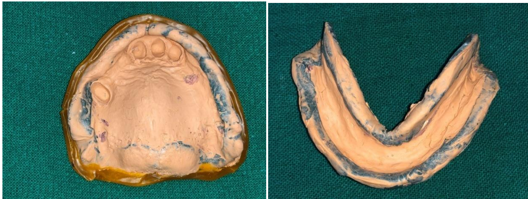
Fig. 5: Maxillary and mandibular final impression