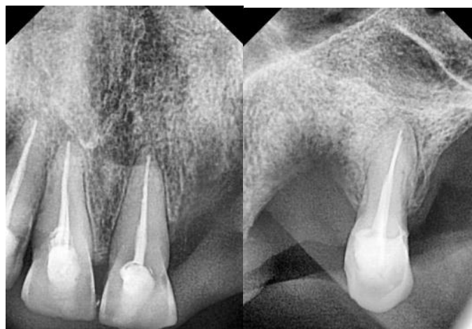
Fig. 3: Post-endo RVG