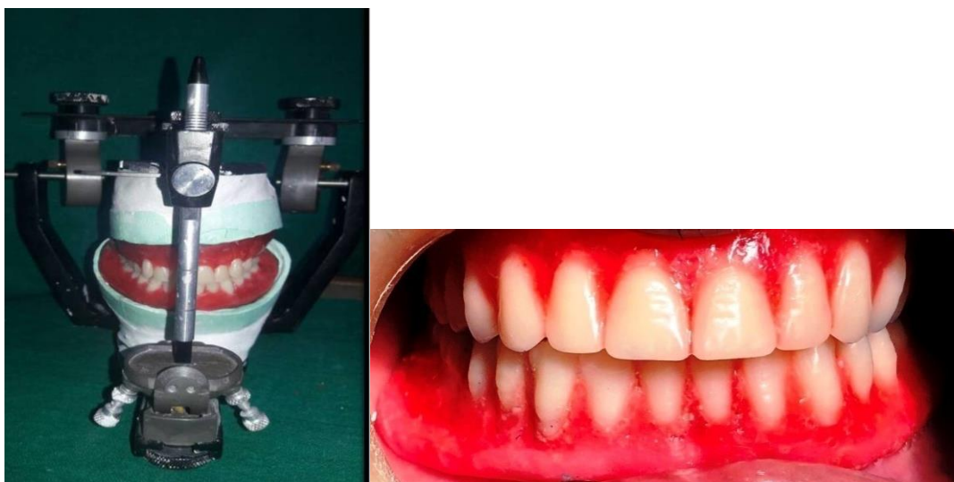
Fig. 7: Try in