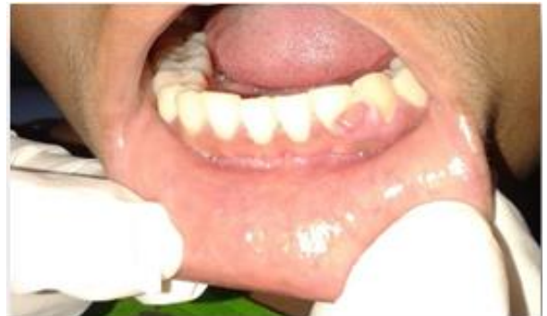
Fig. 1: Intraoral photo showing gingival overgrowth in relation to 32, 33 region

extravasated red blood corpuscle's.(Fig. 4) The above features were suggestive of lobular capillary haemangioma.