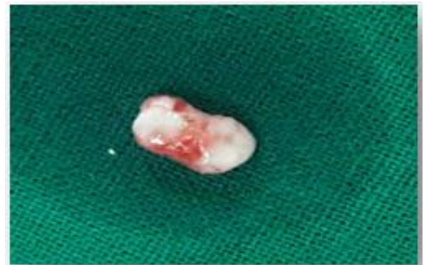
Fig. 2: Excised biopsy specimen