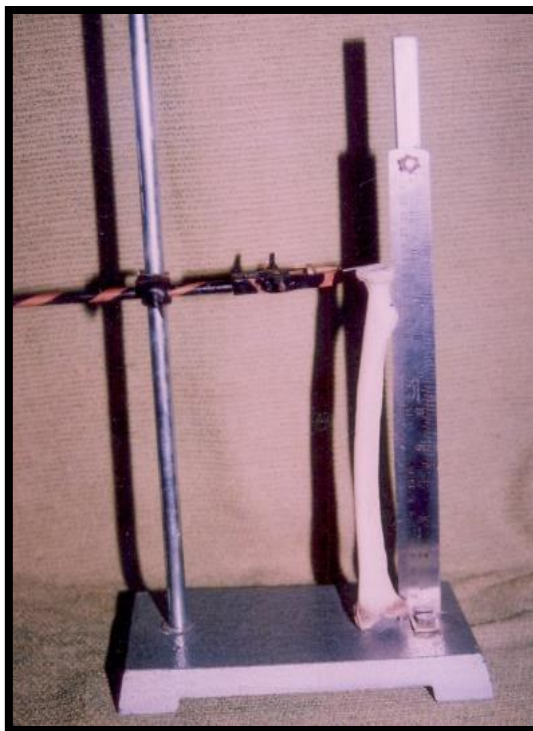
Figure 1: Measurement of the length of radius by Osteometric Scale