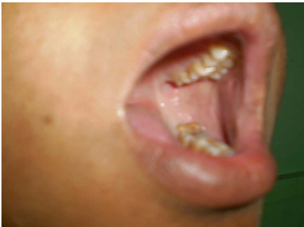
Fig 2: Clinical photograph showing normal appearing left buccal mucosa