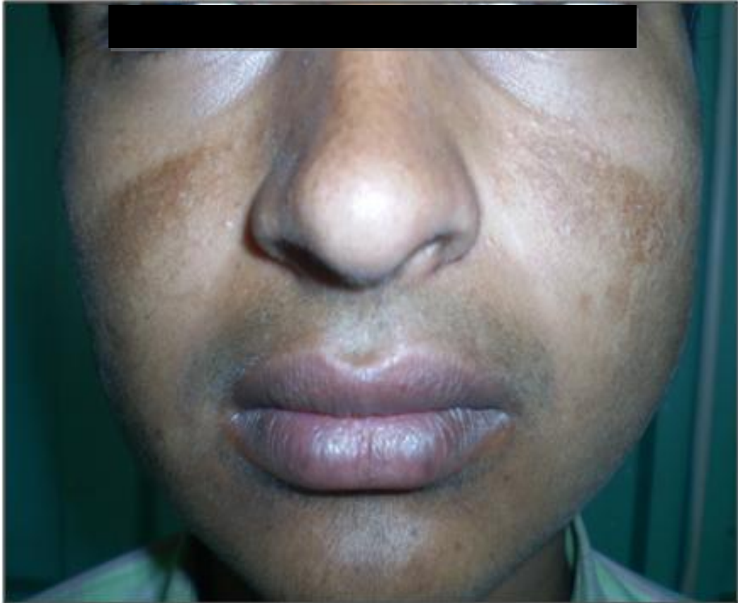
Fig 1: Clinical photograph showing large swelling on the left side of the face