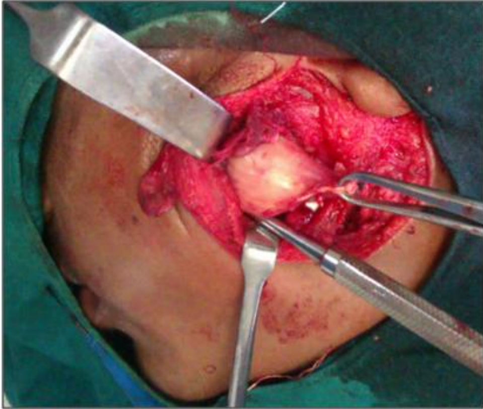
Fig 3: Photograph showing surgical exploration of the lesional tissue in preauricular region