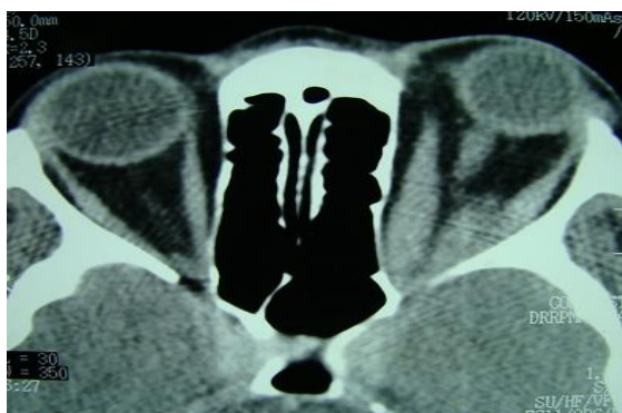
Fig. 3: Axial CT scan through mid-orbit showing left eye, thickening of the medial and lateral rectus muscles with tendon sparing. Asymmetrical changes

tomography (CT) (Fig. 3 & 4) or magnetic resonance imaging (MRI). Magnetic resonance imaging (MRI) can be used to differentiate radiographically between active and inactive diseases. In TAO, the extra-ocular muscles are iso-intense to normal muscle on T1-weighted MRI and hyperintense on T2 depending on the degree of edema (Fig. 5a & b). The absence of edema may demonstrate a fibrotic phase. The correlation of water content (edema) and inflammatory activity can also be detected with MRI short-term inversion recovery (STIR) sequencing. Latest results on the predictive value of the signal intensity ratio (SIR) in MRI-TIRM suggest a correlation between SIR and the clinical activity score (CAS). To differentiate patients with active from inactive eyes disease a cut-off value of >2.5 at 1.5 Tesla was determined. 11 The disadvantage of MRI is the poor visualization of bony structures, making it less suitable as a preparatory assessment for decompression surgery. In comparison, CT displays an excellent view of the bony orbit and paranasal sinuses; information that is mandatory if orbital decompression surgery is being considered.