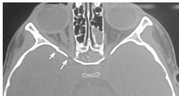
Fig.1: CT Orbit and Brain without contrast showing fracture Greater and Lesser wing of Sphenoid bone

evoked potential (VEP) showed delayed amplitude and prolonged latency in right eye. Neurosurgeon opinion was sought. Patient was continued on Topical antibiotic drops, oral steroids and was explained regarding the visual prognosis of RE. At 1 month follow up the patient was reviewed, examination revealed persistent total afferent pupillary defect, temporal disc pallor on fundus examination and regained extra-ocular movements on RE. Patient's parents were counseled regarding the poor visual prognosis and advised to take proper care of the LE.