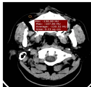
Fig. 1: Axial non contrast CT image demonstrating fat density lesion in right premaxillary region

PNS non contrast high resolution Computed Tomography demonstrated 35x15mm fat density lesion in left premaxillary region, suggestive of lipoma (Fig. 1).