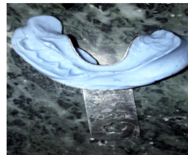
Fig. 5: Preliminary Impression

Preliminary impressions were made with irreversible hydrocolloid using stock metal trays. (Fig. 5). Casts were prepared and custom trays were fabricated (Fig. 6). The tray was border-molded with modeling plastic (DPI Tracing stick. Dental products of India, Mumbai, India). Final impression was made with light-body vinyl polysiloxane (Aquasil, Dentsply, Milford, DE) (Fig. 7). This impression material was chosen to produce minimal tissue displacement. Impression was poured with type III dental stone to obtain a master cast. Record base was fabricated and wax occlusal rim was made. Maxillomandibular relation was recorded with wax interocclusal record.