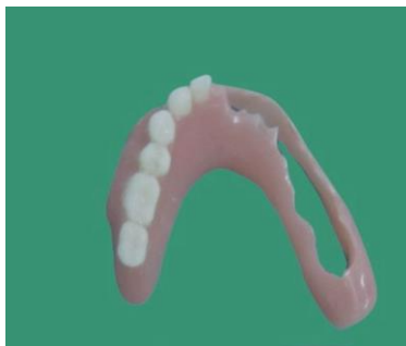
Fig. 8: Cu-sil Denture

A 21 gauge stainless steel orthodontic wire was manipulated to obtain the framework of the guide flange prosthesis in mandibular arch. The framework consisted of a rectangular wire projection for the guide flange having width equal to the combined width of the opposing two maxillary premolars. The retentive arms of the framework passed to the lingual side mesial to mandibular first premolar and distal to mandibular first molar. A maxillary retentive plate was fabricated with Adam's clasps on left and right maxillary first molars to stabilize the maxillary teeth against the pressure exerted by the mandibular guide flange. A wax set-up was tried in the mouth and was checked for esthetics, phonetics, occlusal vertical dimension and occlusion. The denture was fabricated, finish and polished. (Fig. 8)