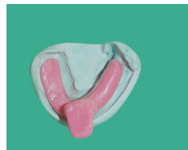
Fig. 6: Custom Tray