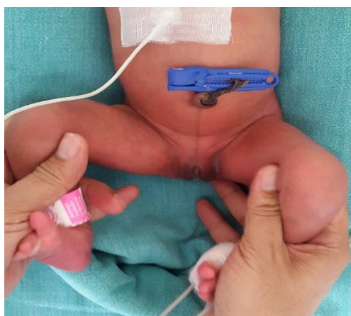
Fig. 1: Ortolani's test involves applying forward pressure to each femoral head, attempting to reduce

The Ortolani test, was performed by applying forward pressure to both the femoral heads, trying to reduce a posteriorly dislocated femoral head back into the acetabulum. The examining hand grasped the affected hip with the thumb on the medial aspect of the thigh and the middle and index finger along the greater trochanter. The hip and knee was then flexed to 90° and abducted with the middle and index finger pushing the trochanter forward. A palpable clunk suggested that the hip was dislocated or subluxed, but reducible.