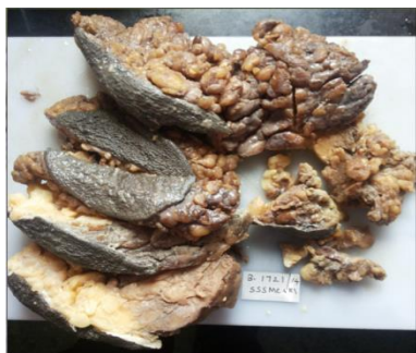
Fig. 2: Shows cut-Section of the specimen skin with homogenous light yellowish areas