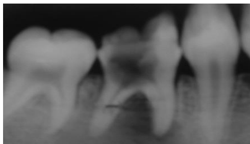
Fig. 1: Preoperative Radiograph

the mandibular extending to body of the mandible. Intraoral examination revealed that Oral hygiene status of patient was fair and Grade I mobility was evident in the 46. Tooth was tender on percussion and vitality test was negative.