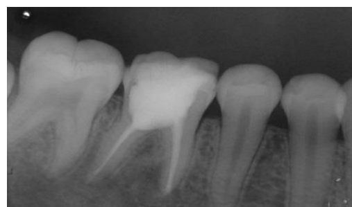
Fig. 6: Obturation w.r.t.46

The patient was offered three treatment choices – non surgical endodontic therapy, periapical surgery, or extraction and prosthetic replacement. She was averse to surgery and opted for non – surgical treatment. She was further keen to preserve the existing crown, as she was satisfied with its function. Conventional root canal treatment was initiated at the second appointment (Fig.2). After bio-mechanical preparation of canals, a non-setting calcium hydroxide paste (Metapex, Meta Biomed Co. Ltd.) was dispensed into the canals and temporary restoration was placed (Fig.3), some of the metapex extruded beyond the apex of the tooth 46 which had undergone resorption itself with time . Follow up was done after one week and when the patient was asymptomatic, tooth was restored with Glass ionomer cement. Further follow-up radiographs were taken at 2 months (Fig-4), 4 months (Fig-5), at 6 months follow-up the tooth was obturated (Fig-6) and at 8 months follow-up visit it was seen that there was resolution of the radiolucency w.r.t 46 (Fig- 7).