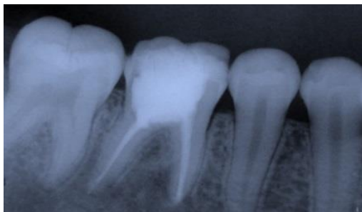
Fig. 7: 8 Month Follow up

Radiographic changes showed in series of follow ups that there was significant reduction in lesion and appearance of new trabeculae pattern and increased bone density in the periapical area. Finally, tooth was obturated with lateral condensation with gutta percha points, followed by permanent restoration with Glass ionomer cement and crown. Recall appointments consisted of reinforcement of oral hygiene instructions, scaling if required and periapical radiographs of the involved tooth.