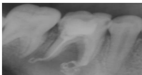
Fig. 3: Intracanal Dressing with Metapex