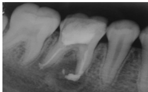
Fig. 4: 2 Month Follow up