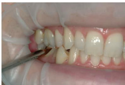
Fig. 1: Evaluation of active tactile sensibility tooth vs tooth situation

The active absolute threshold level is determined by inter occlusal detection of small objects such as foils. When using foil materials with a high thermal conductivity such as aluminum or steel, a lower inter occlusal threshold level is obtained. This is due to the interaction of thermal receptors in the dental pulp. (10)