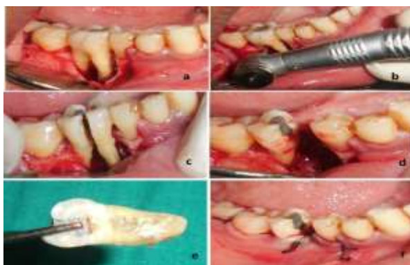
Fig. 2: Intra-operative photographs of tooth # 46 a) full thickness flap reflection, showing bony defect along the mesial root b) a rotary instrument is used to make vertical cut toward the bifurcation area c) immediately after hemisection of crown d) immediately after removal of resected mesial root along with remaining crown e) resected mesial crown-root portion f) flap closure with 4-0 black silk sutures