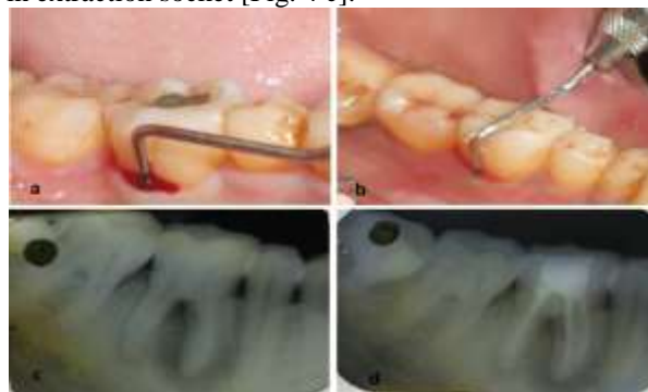
Fig. 1: Pre-operative photographs and radiographs of tooth #46: a) 13 mm probing pocket depth i.r.t buccal aspect b) 14 mm probing pocket depth i.r.t lingual aspect

The further follow up was done up to 3 months, where mobility significantly reduced from grade II to no mobility and significant bone formation seen on radiograph [Fig. 3 c]. After 3 months, fixed metal prosthesis involving retained distal half and mandibular second premolar was given [Fig. 4 a]. The FPD and hemisectioned distal root is well maintained and stable after 2 years [Fig. 4 b]. 2 year follow-up radiograph shows no widening of periodontal ligament space along with retained distal root and significant bone formation in extraction socket [Fig. 4 c].