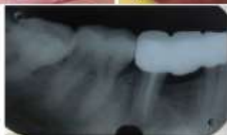
Fig. 4: Photographs and radiograph showing fixed partial denture i.r.t tooth #45 & retained distal half of tooth #46 a) buccal view of FPD placed after 3 months of surgery b) post-operative clinical photograph after 2 year, showing well retained functional prosthesis c) post-operative radiograph after 2 year, showing well retained functional prosthesis