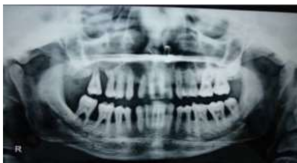
Fig. 2: Panoramic radiographic view showing generalized severe bone loss