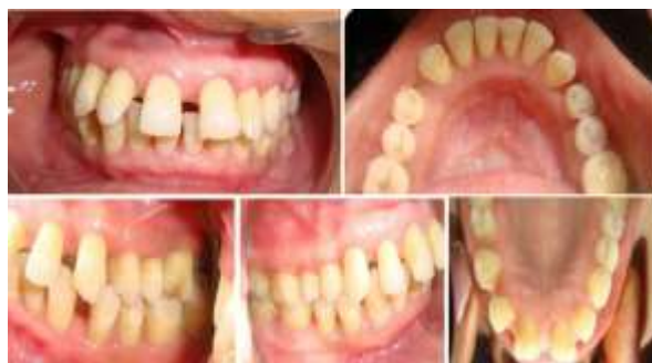
Fig. 5: Postoperative intraoral labial, left lateral, right lateral showing both maxillary and mandibular arches

Treatment: Initial treatment consisted of oral hygiene instructions followed by scaling and root planing (SRP). 6 weeks after SRP full mouth internal bevel gingivectomy followed by open flap debridement was done under local anesthesia (Fig. 3). Procedure was performed sextant wise. The patient was given amoxicillin/Clavuanate and metronidazole three times a day to prevent bacteremia and acefenac 500 mg twice a day to relieve postoperative pain. Periodontal dressing (Coe Pack) was given and was removed after 1 week. Excised tissue was sent for histopathological examination. It revealed hyperkeratosis, elongated rete pegs, numerous collagen bundles and inflammatory infiltrate (Fig. 4). Patient was recalled every 3 months. There was uneventful healing with no recurrence during 2 year postoperative period (Fig. 5).