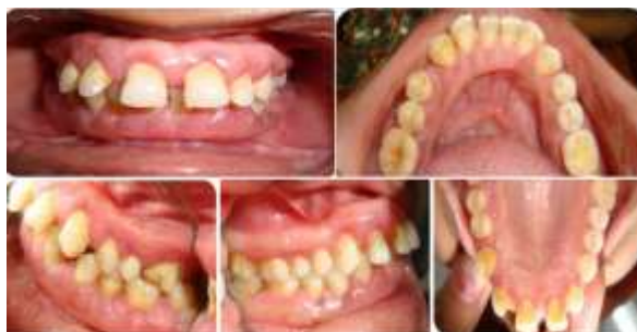
Fig. 1: Preoperative intraoral labial, left lateral, right lateral showing both maxillary and mandibular arches