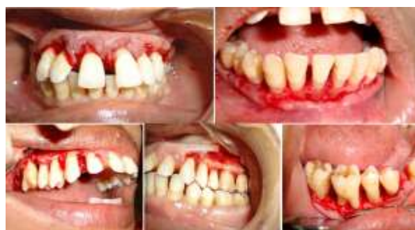
Fig. 3: Open Flap debridement and internal bevel gingivectomy

Treatment: Initial treatment consisted of oral hygiene instructions followed by scaling and root planing (SRP). 6 weeks after SRP full mouth internal bevel gingivectomy followed by open flap debridement was done under local anesthesia (Fig. 3). Procedure was performed sextant wise. The patient was given amoxicillin/Clavuanate and metronidazole three times a day to prevent bacteremia and acefenac 500 mg twice a day to relieve postoperative pain. Periodontal dressing (Coe Pack) was given and was removed after 1 week. Excised tissue was sent for histopathological examination. It revealed hyperkeratosis, elongated rete pegs, numerous collagen bundles and inflammatory infiltrate (Fig. 4). Patient was recalled every 3 months. There was uneventful healing with no recurrence during 2 year postoperative period (Fig. 5).