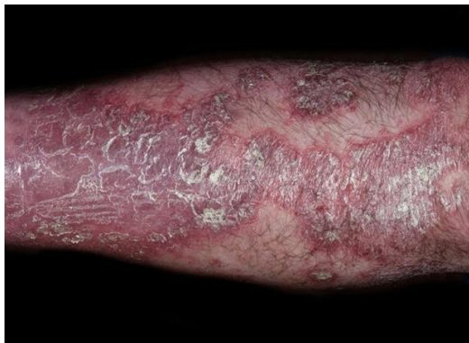
Fig. 1: external examination at autopsy revealed psoriatic scales

Cause of death was ascertained as respiratory failure due to bronchopneumonia with secondary renal amyloidosis in a case of psoriatic arthropathy.