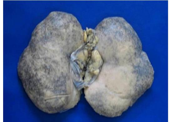
Fig. 2: Gross photograph of large white kidney suggestive of renal amyloidosis