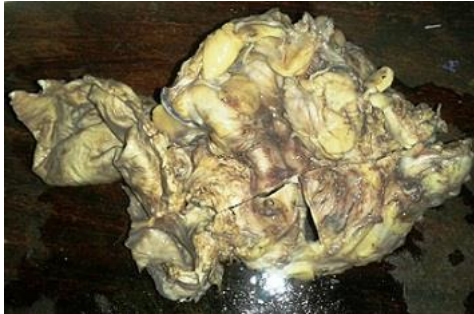
Fig.1: Gross appearance of the resected specimen

placed and the wound closed. The histopathological examination of the resected specimen suggested mature teratoma with areas of squamous cell carcinoma changes i.e., Teratoma with malignant transformation (Figs. 2 and 3). The malignant squamous part showed positivity with Cytokeratin (Fig. 2b). Post-operative period was uneventful and the patient was discharged with an advice for regular follow up.