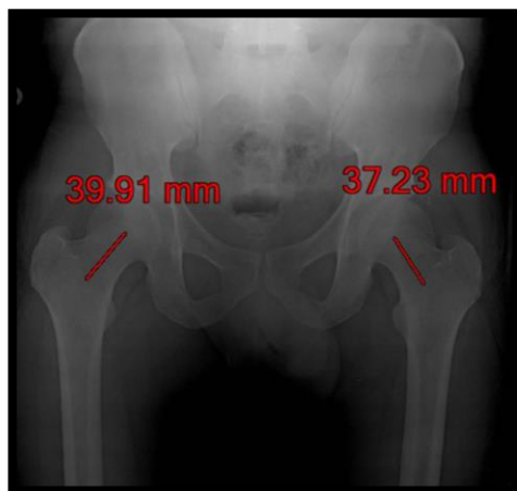
Fig. 2: Measurement of Neck Length