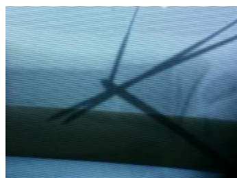
Reduction & k wiring