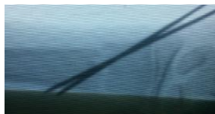
Final AP view