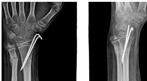
Fracture callous at 3 wks