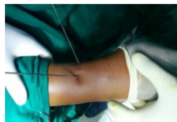
Intra focal pinning clinical