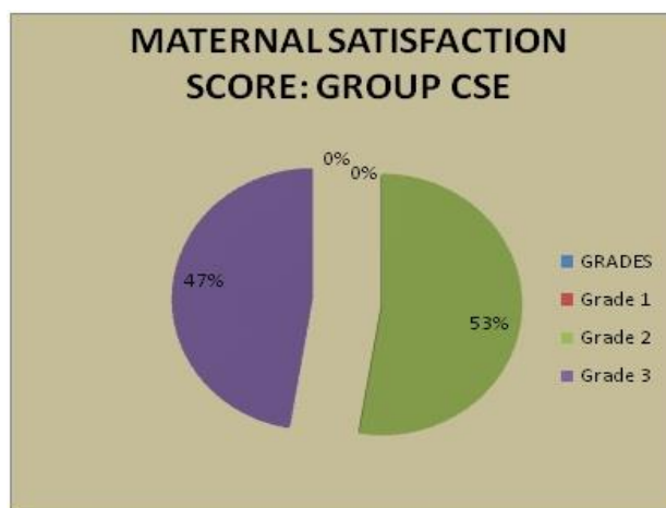
Fig. 1: Maternal satisfaction score CSE

The data of * 3 patients in epidural group and †1 patient from CSE group were excluded from analysis as they require LSCS.