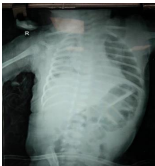
Fig. 1: Chest X RAY-suggestive of loculated radiolucent shadow without pulmonary marking in left middle and lower zone