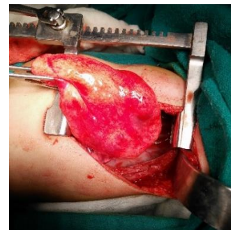
Fig. 3: Intraoperative dissection of CCAM

A three day old male baby weighing 4.2 kg with normal vaginal delivery at home, with no significant antenatal/ perinatal history, presented to pediatric emergency in respiratory distress, respiratory rate varying between 60-70/minute, high grade fever, oxygen saturations ranging between 78-95% and was