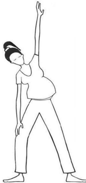
Fig. 2: Modified triangle pose